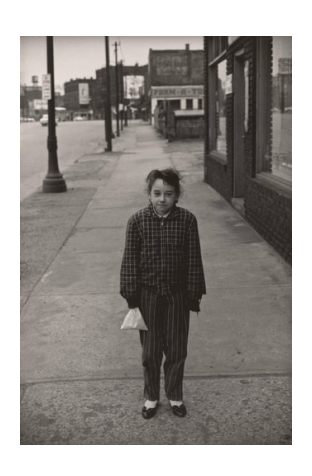
LEE FRIEDLANDER American, b. 1934