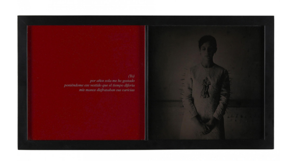
LOUIS GONZALEZ PALMA

Untitled (Patron Saint of Girl Power) Painted wood, metal, fabric n.d.