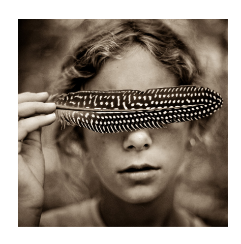
LORI VRBA American, b. 1964

Blindfold Toned Gelatin Silver Print 2012