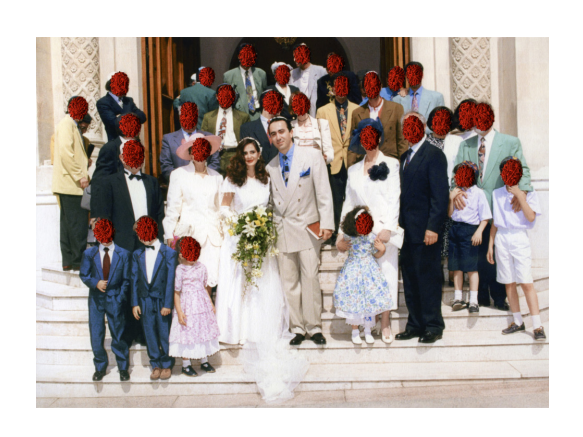
2. ELI REED

Seuls au Monde (Alone in the World), Photos Souvenirs: Édition Spéciale #5 Archival Pigment Print with Silk Thread Embroidery 2016