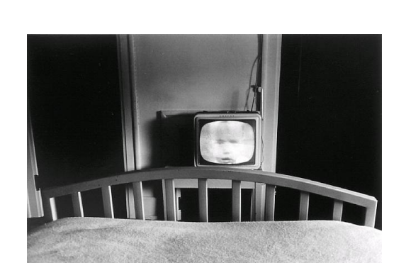
LEE FRIEDLANDER American, b. 1934

Galax, Virginia Gelatin Silver Print 1962/2001