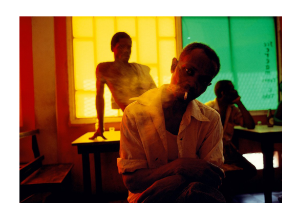
ALEX WEBB American, b. 1952