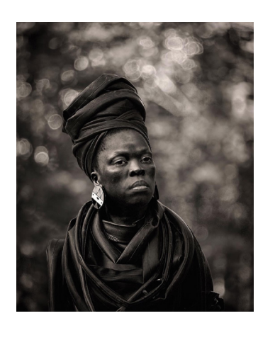
ZANELE MUHOLI South African, b. 1972

Basizeni XI, Cassilhaus, Chapel Hill, North Carolina Gelatin Silver Print 2016