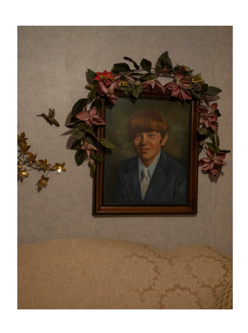
MATT EICH American, b. 1986

Untitled, Isom, Kentucky 2020 Archival Pigment Print 2020