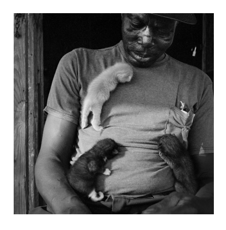
KEITH CARTER American, b. 1948

Raymond Dye Infused Pigment Print on Coated Aluminum 1991