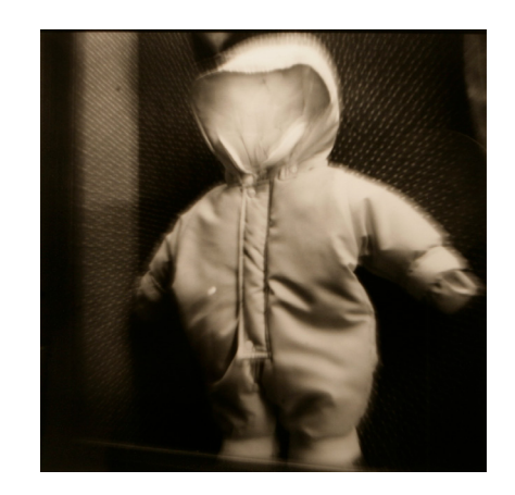
MIMMO JODICE Italian, b. 1934 Picolo Abioto (de la Serie Eden) Vintage Gelatin Silver Print 1996