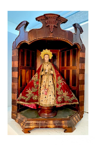
UNKNOWN Possibly Eastern European

Untitled (Patron Saint of Girl Power) Painted wood, metal, fabric n.d.