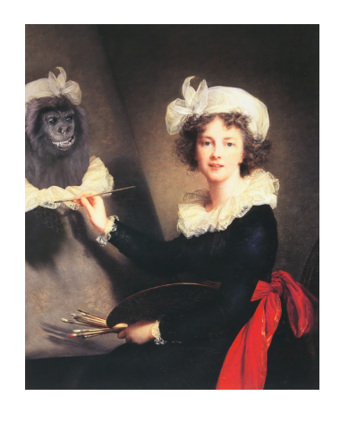
7. PETAH COYNE

MuMu X, London, 2019 Archival Pigment Print 2019