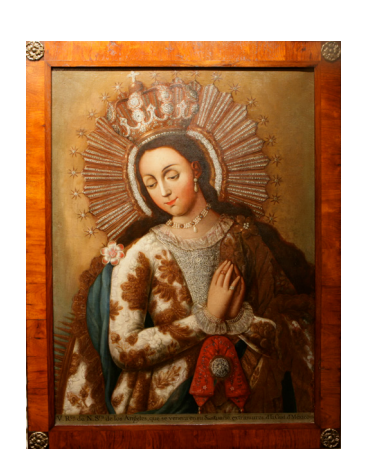
UNKNOWN Possibly Mexican

Young Boy with Mickey Mouse Ears, China '85 Gelatin Silver Print 1985/c. 1995