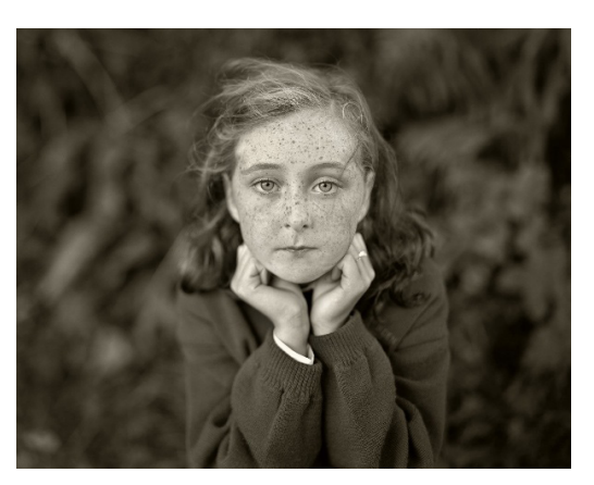
JOCK STURGES American, b. 1947