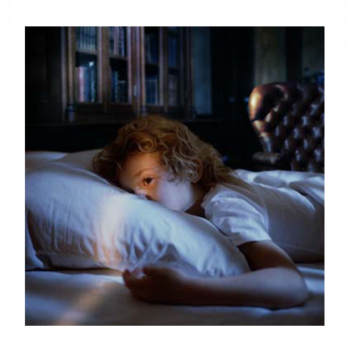
SIMEN JOHAN Norwegian, b. 1973

(Yo) n.1, from Conjugación de Intimidad Mixed Media 2006