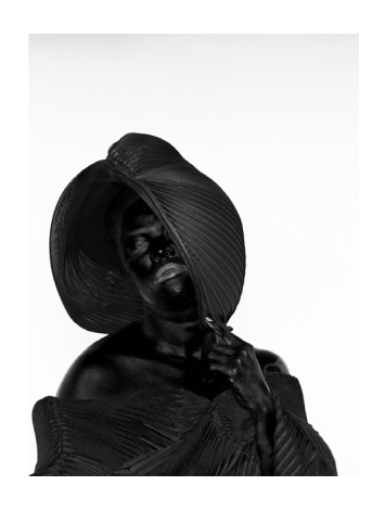
6. ZANELE MUHOLI

La Tapisserie (The Tapestry), Photos Souvenirs: Édition Spéciale #4 Archival Pigment Print with Silk Thread Embroidery