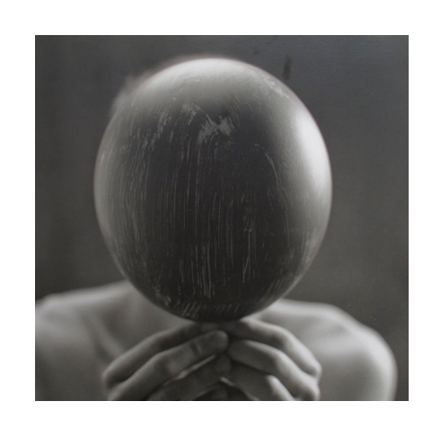
JACK SPENCER American, b. 1951

Boy with Balloon Gelatin Silver Print 1990